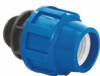
PP COUPLING MALE