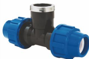
PP TEE COUPLING FEMALE