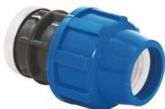
PP COUPLING FEMALE