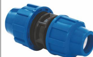
PP REDUCING COUPLING