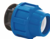
PP END PLUG