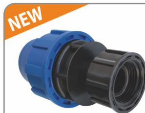
PP COUPLING WITH OR