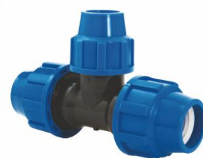
PP TEE REDUCING COUPLING