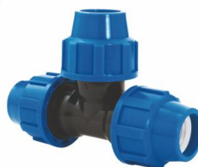
PP TEE COUPLING