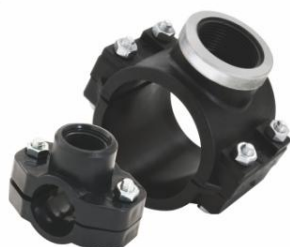
PP CLAMP SADDLES