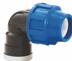
PP ELBOW FEMALE