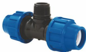
PP TEE COUPLING MALE