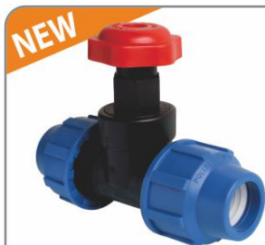
PP STOP VALVE