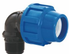
PP ELBOW MALE