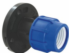
PP FLANGED ADAPTOR