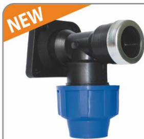
PP WALL SUPPORT ELBOW